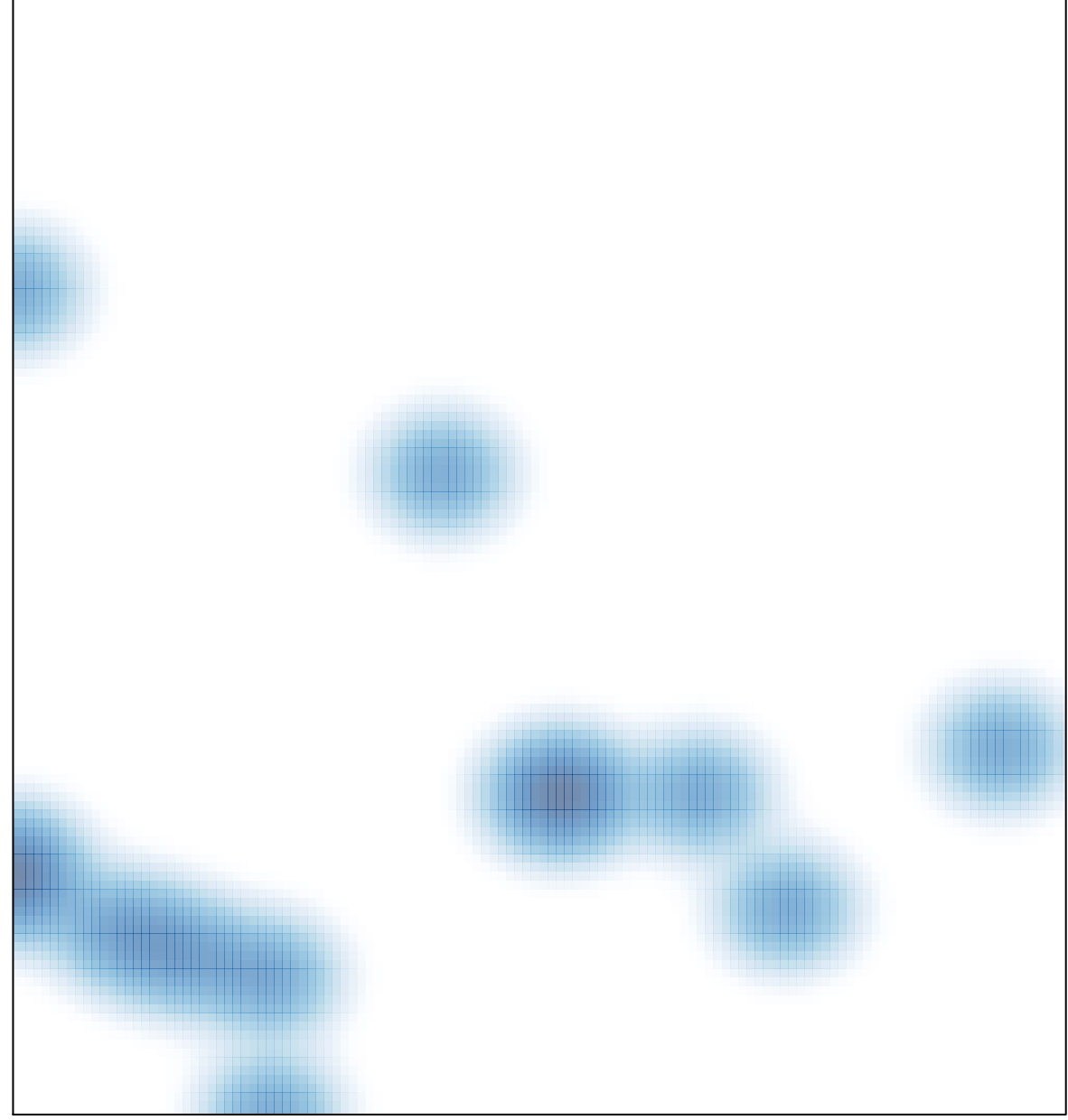
# features = 15, max = 1